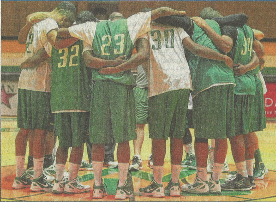
Members of the Wilberforce men's basketball team join together at the beginning of practice Thursday. The team hasn't had a winning record in more than a decade but is now one game away from a trip to the national tournament.